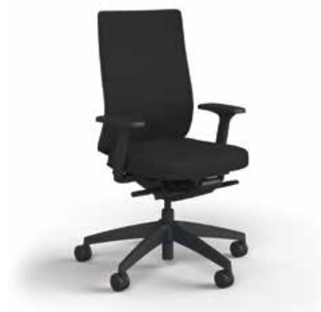
se:do Cushion, with armrests