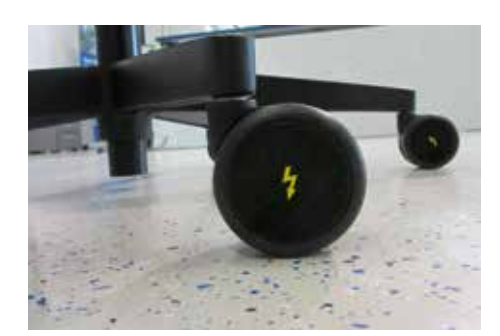
se:do also ESD version available