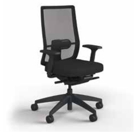
se:do Membrane, with armrests