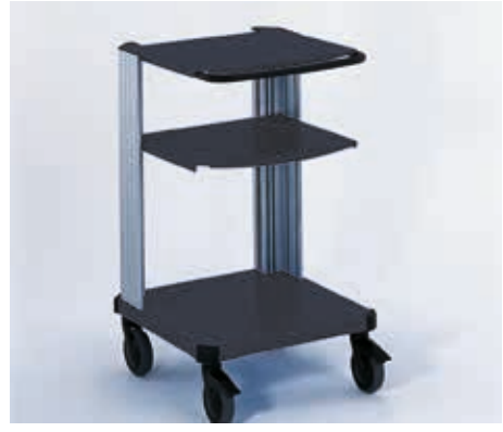
Metramobil Basic height 900 mm