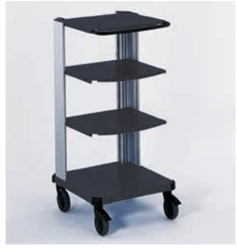
Metramobil Basic height 1120 mm