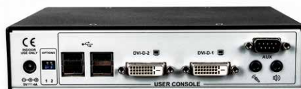
Avocent HMX 6200R