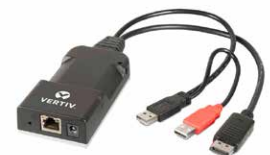
Avocent HMX 5150 Dongle