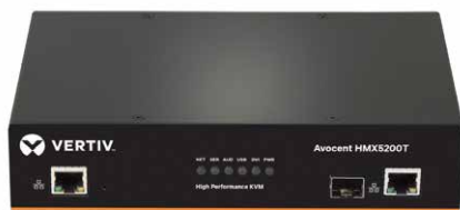
Avocent HMX 5200T